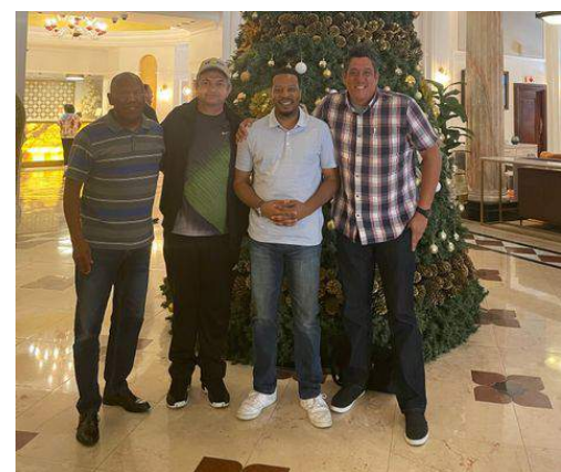
Pastors and Leaders in Capetown