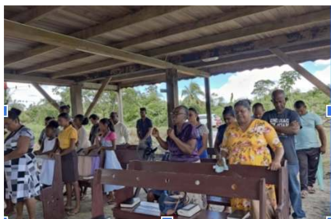
Faith Tabernacle, Church in the Mara village

(From Revival Tabernacle Church in Guyana; South America)