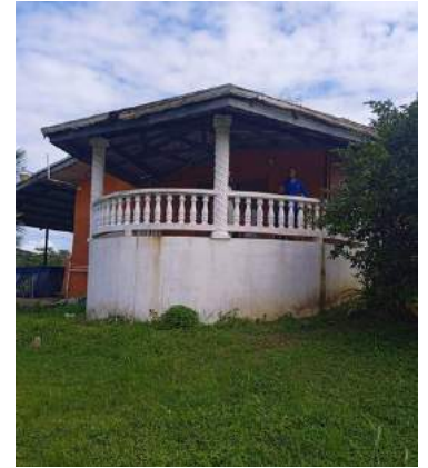
More Excellent Way Church